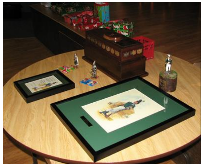
Society awards and presidential kukri on display at the meeting