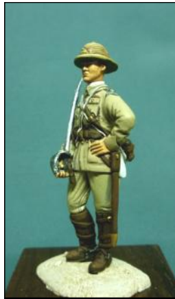
New Del Prado figures of Sir Isaac Brock and Winston Churchill.