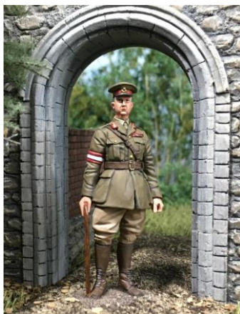
Lt. General Sir Arthur Currie Exclusive figure by William Britain Limited

Several of our members have asked for the return of this friendly and festive competition, which was an OMSS tradition for years. But you know what happens to traditions that are no longer used--it would be a shame to lose this fun feature just because YOU weren't in the mood to enter just one figure...it all depends on YOU.