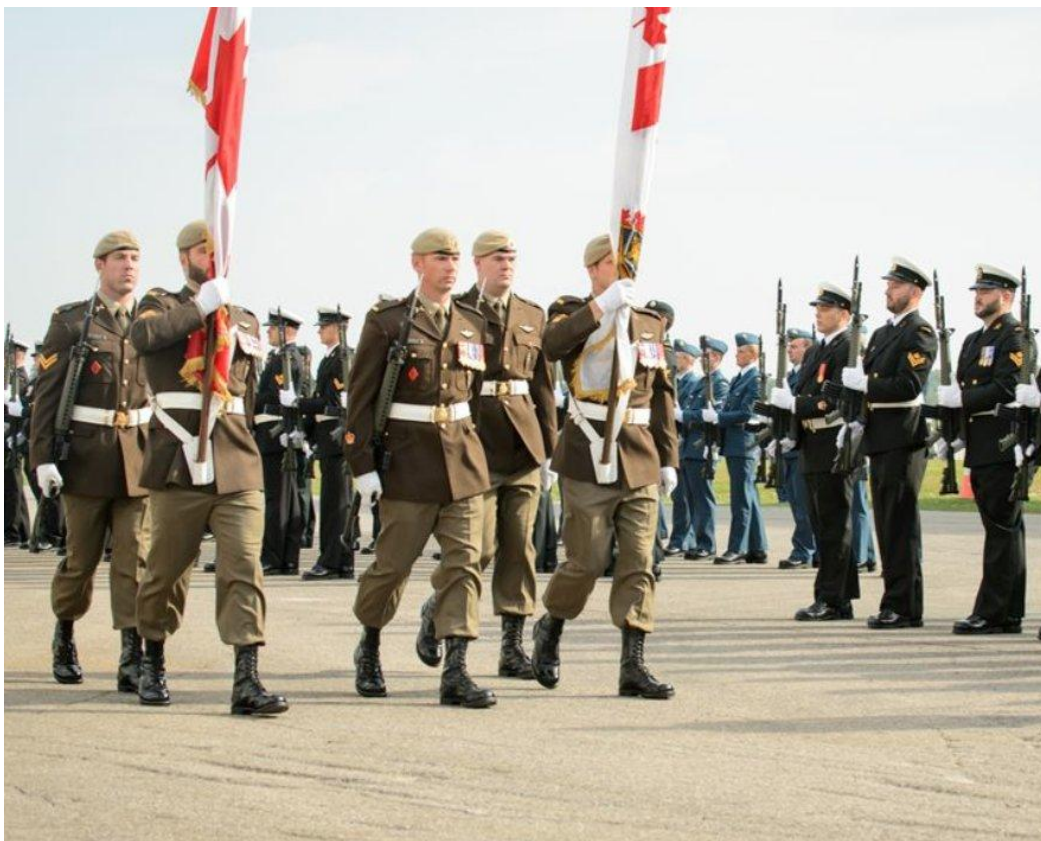
Members of Canada's Special Service Regiment parade in their new Ceremonial Uniforms: Note these are the Canadian Flag and CF Ensign, not regimental colour therefore Sergeants carry the flags not officers

The Canadian Special Operations Regiment (CSOR) ; French: Régiment d'opérations spéciales du Canada , ROSC) is a highly trained, mobile, special operations forces unit. The mission of CSOR is two-fold: to provide back-up to Joint Task Force 2 (JTF2), the Canadian Forces' (CF) main special operations forces (SOF) unit; and to provide the CF with a SOF unit that can be deployed anywhere in Canada or internationally. CSOR is a battalion-sized, light infantry high-readiness special operations unit part of Canadian Special Operations Forces Command (CANSOFCOM) CSOR is capable of conducting and enabling a broad range of missions, including direct action, special reconnaissance, counter-terrorism, and defence diplomacy and military assistance.