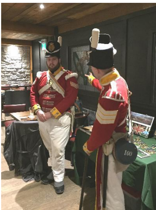
Reenactors from the 100 th Regt of Foot

If any Toronto OMSS members are planning a visit to Ottawa, be sure to contact us!