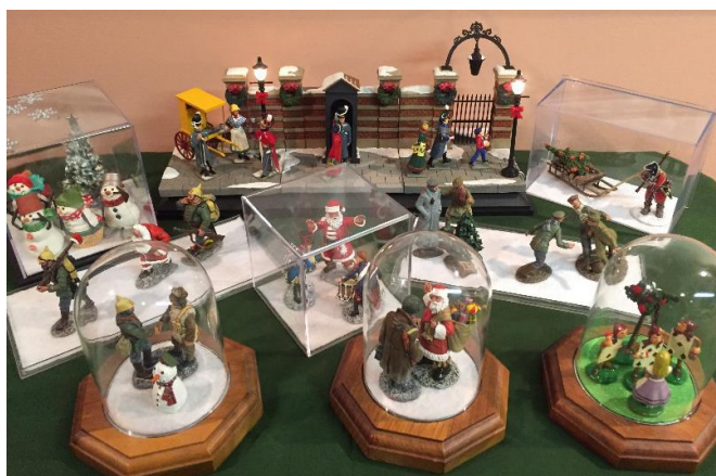
Christmas Themed Dioramas