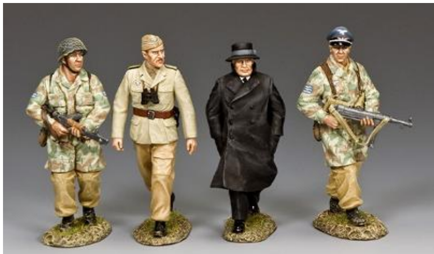
King & Country's Otto Skorzeny, Benito Mussolini and two German Fallschirmjagers