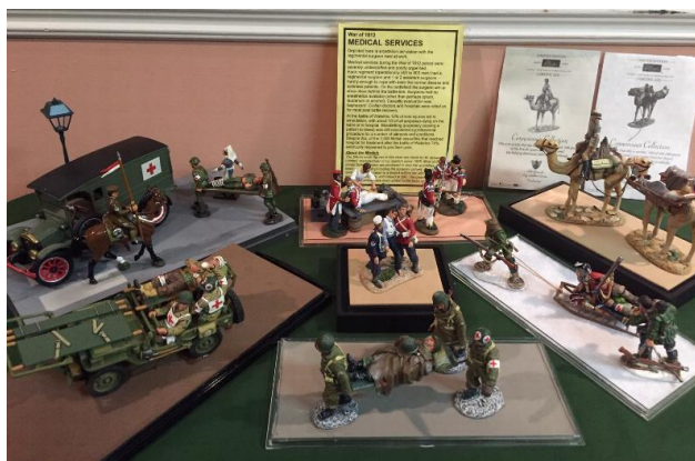
Medical Services Dioramas