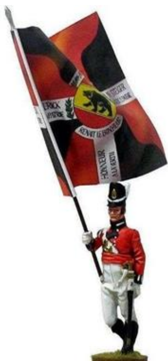
De Watteville Regimental Colour

Kronprinz Miniatures have added the King's Colours to their two War of 1812 British Regiments. Shown here are the Regimental Colours as they are a little more colourful and unique. Foot figures include Officers, NCO, Privates and a Fifer. Figures sell for approximately $51.00 Cdn each, with the Colours going at $57.00. Several members who have purchased this Spanish line of figures were surprisingly pleased. The figures are around 1/30 th scale and painted in a matte finish, with textured bases. There is a wide field of choices from the Renaissance period to World War Two. The company has just introduced a series of 28 mm ship's sailing crew. While these figures represent the 18 th century Spanish Navy, many can be used to fill out crews on any ship of that time period. This little known company is worth checking out.