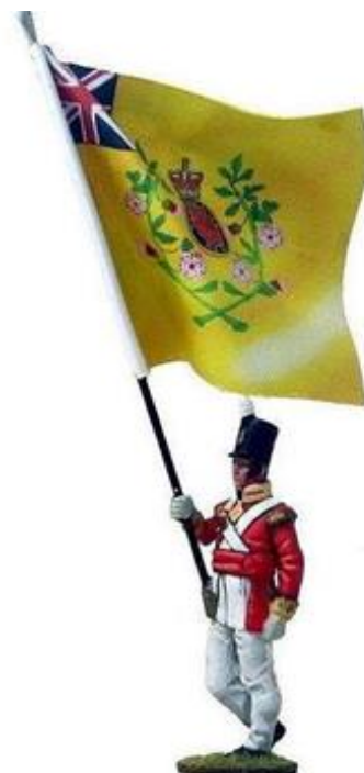
104 th Regt of Foot (The New Brunswick Regiment) Regimental Colour

Kronprinz Miniatures have added the King's Colours to their two War of 1812 British Regiments. Shown here are the Regimental Colours as they are a little more colourful and unique. Foot figures include Officers, NCO, Privates and a Fifer. Figures sell for approximately $51.00 Cdn each, with the Colours going at $57.00. Several members who have purchased this Spanish line of figures were surprisingly pleased. The figures are around 1/30 th scale and painted in a matte finish, with textured bases. There is a wide field of choices from the Renaissance period to World War Two. The company has just introduced a series of 28 mm ship's sailing crew. While these figures represent the 18 th century Spanish Navy, many can be used to fill out crews on any ship of that time period. This little known company is worth checking out.