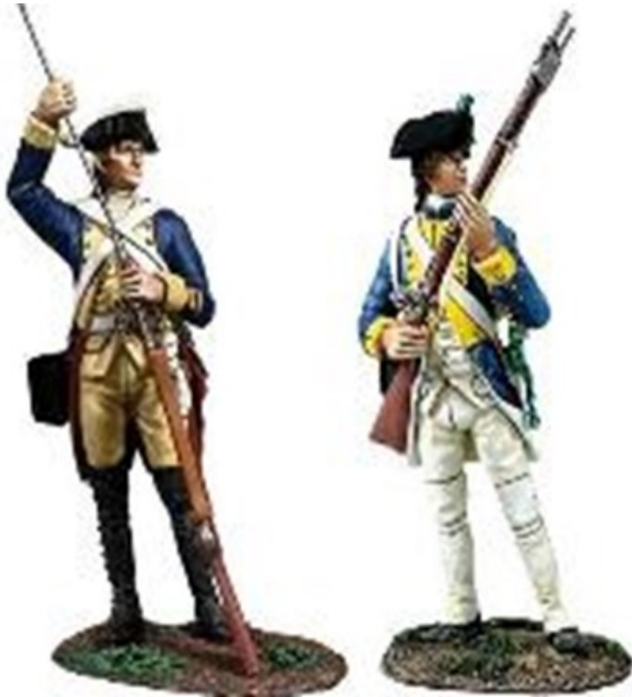
William Britain Limited's Hessian Regiment Von Donop and French Royal Deux-Ponts Regiment

The latest edition of Toy Soldier Collector & Historical Figures: Issue 119, features this year's "ON PARADE 2024". There are a variety of photos showing displays, vendors and competition pieces. The magazine retails for $19.00 Cdn.