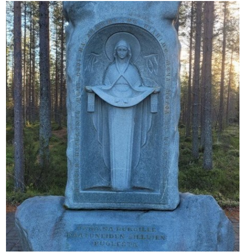
Russian 44 th Division Memorial