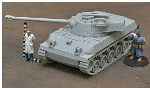
An example of what can be done with 3-d printing from Dobbies Hobbies