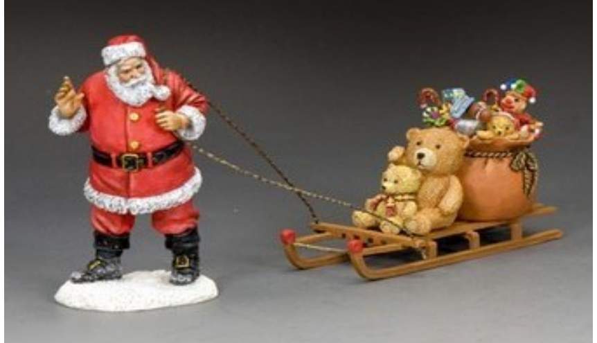
King & Country's "Santa and his Sledge"

King & Country Miniatures has released a nice version of Santa with a sledge full of toys this year. Each year King & Country releases a unique set for the Christmas period and this Coca Cola style Santa is a real eye pleaser. It is selling for approximately $175.00 Cdn.