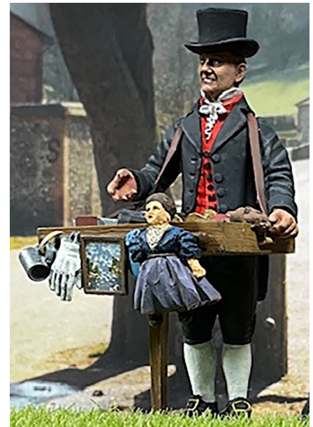
W. Britains artwork of Village Peddler

The stylish and smiling 'Village Peddler 1805-1820' figure modelled after James wears a top hat and holds a tray full of goods including what else but toys.