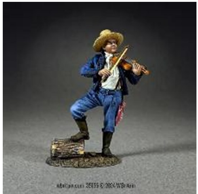
William Britain Limited's "Fiddlin Away"