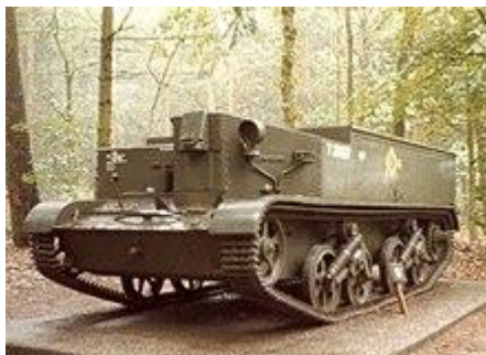
Windsor carrier, Overloon Museum