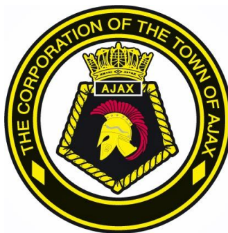
Town of Ajax Crest

Montevideo and due to neutrality laws was only granted 72 hours to make ready for sea. By this time British counterintelligence had spread the rumour of capital ships waiting at the mouth of the River Plate, and rather than have his crew killed off needlessly, Captain Langsdorff scuttled his ship. Today you will see reminders of the Ajax, Achilles and Exeter's crews (plus those of the RN Frigate Ajax, commissioned in 1962) in the municipality as any street that has an anchor or ship on its street sign is named after a crew member.