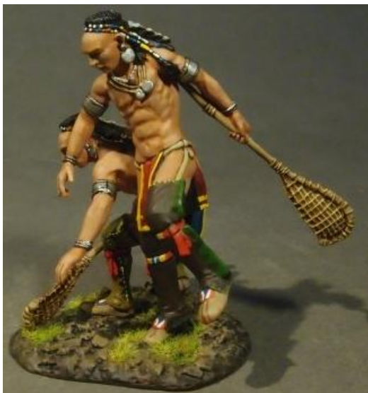
JJD's WIM-11 Lacrosse Players, Woodland Indians

And finally, John Jenkins has reproduced 10 figures from its “War of 1812” series depicting the Royal Scots during the Battle of Chippewa, 5 July 1814 as part of its 10-year anniversary booster/starter sets. Unfortunately for Canadian collectors, these redcoats are getting clobbered by the American invaders. JJD has also produced some additional Quebec militia for its French & Indian War series and First Nations lacrosse players for its “Woodland Indians” series.