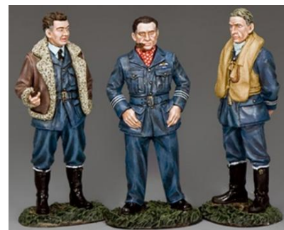
K&C's RAF075 "A Trio of Aces"

King & Country has released a three figure set of Royal Air Force aces, including Douglas Robert Stuart Bader and Alan Christopher Deere. Bader was the Squadron Leader of No. 242 Squadron, composed