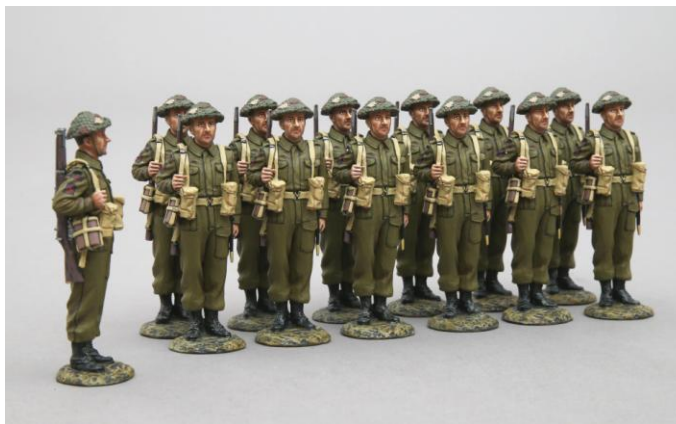
TGM'S CAN001 Royal Canadian Navy Beach Commando 'W'

OMSS members should be pleased with this month's releases by the major toy soldier manufacturers, since September