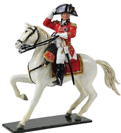
WB's 47061 King George III Mounted, 1798

For collectors who prefer glossy soldiers, WB has added figures to its "Regiments" collection depicting the 10 th Light Dragoons and the Horse Guards, circa 1795. Figures of the Prince Regent and King George III have also been produced to accompany the figures.