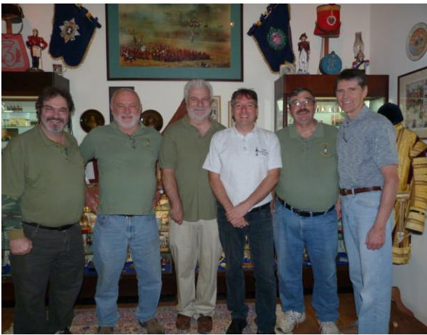
Canadian & American OMSS Members at Hillsteads

Show the next day in Hackensack NJ. The mint green shirts of the OMSS were very noticeable as many of the dealers made comments about all the Canadians present at the show. A surprise for many was the appearance of Canadian comedian Mike Myers. The Toronto native, who now lives in New York City has collected for around 35 years. There were approximately 300 tables at this show, featuring a wide variety of plastic and metal figures. Prices vary on items, some are good, some not as good as you would find at our own ON PARADE. The show runs from 9 am until 3 pm and everyone you talked to seemed to have a great day.