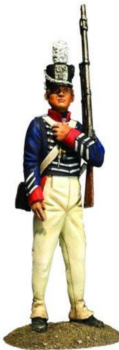
10072 U.S. Infantryman 1811-1812

“A mere matter of marching.” That’s how difficult the former U.S. President Thomas Jefferson thought conquering Canada would be in the summer of 1812. Fortunately for Canadians today, the British regulars, Native American warriors and Canadian militia would prove him wrong. The American Army entered the war woefully unprepared and was regularly beat by British troops. By the war’s conclusion,