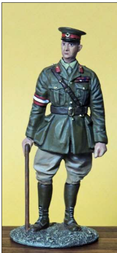
Limited Edition Lieutenant General Sir Arthur Currie