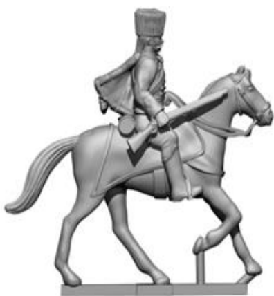
Seven Years War Hussar Trooper with Fur Busby