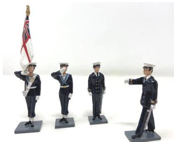
"Piping the Side" set by The British Toy Soldier Company

This is the Chinese New Year and at this time most of the manufacturers have little new to offer. That said however I had seen a preview of BTSC's "Piping the Side" set a few months ago. Unfortunately, at that time the Royal Navy white Ensign was painted upside down. I was pleased however to see that this was corrected when the set was released. It is a wonderful little themed set that will also fit in with BTSC's Royal Navy route liners standing at present arms. The White Ensign is carried in this case by a rating. This is acceptable as it is not the Queen's or King's Colour. Non-commissioned members can be assigned to carry the Ensign which is similar to a