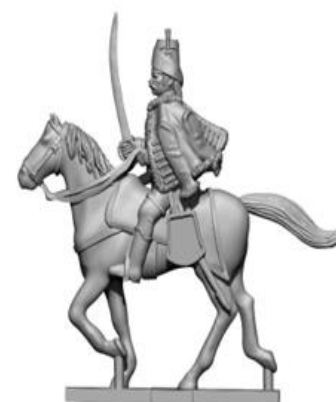
Seven Years War Hussar Trooper with Mirliton