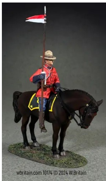
10174—RCMP Mounted Trooper