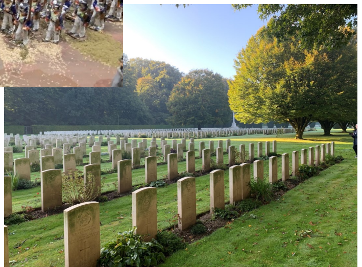
Rheinberg Forest War Cemetery

Of course, no trip would be complete without seeing some Toy Soldiers!