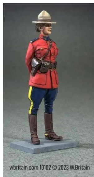
10102—RCMP Female Trooper

Thanks to Doug Cope for contributing to the following;