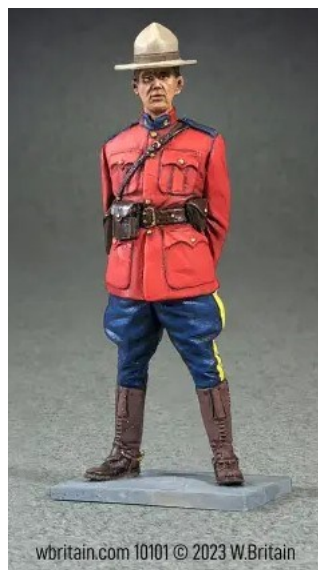
10101—RCMP Male Trooper

W. Britain's also produces a series of detailed RCMP figures amongst other Canadian figures.