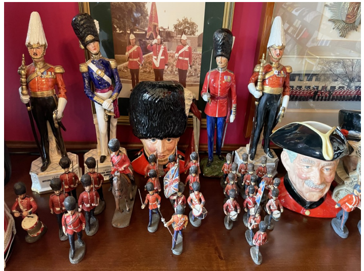
German composition figures depicting British soldiers