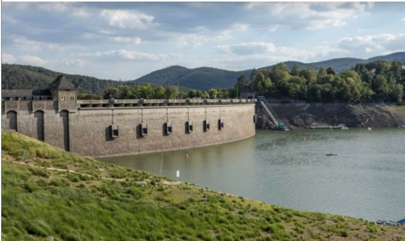
Edersee Dam, one of the dams destroyed by the Dam Busters (since rebuilt)