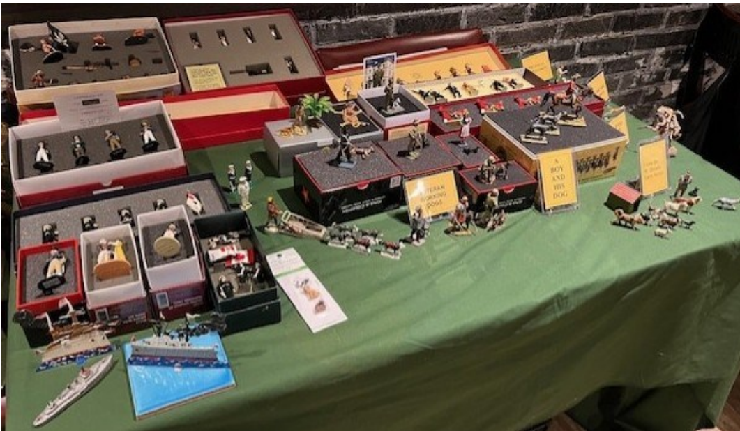
Bob’s combined display for Show and Tell of “Cats and Dogs” and a variety of Naval pieces

The consumption of a tin of home baked shortbread in the shape of cats, dogs & penguins offered by Juan’s daughter rounded out an enjoyable evening.