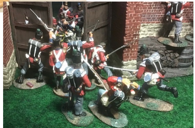
Photos above are from Eric's presentation of closing of the gates at Waterloo